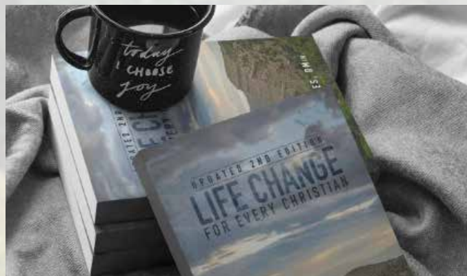
Life Change For Every Christian $17.95