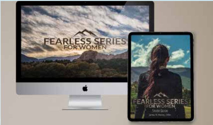
Fearless Series for Women Digital Series Access $74.95

The Fearless Series for Women is a 5-week video series that is available for digital access for 8 weeks after purchase. It also has an accompanying Study Guide. Additionally, there is a follow-up Workbook for women who want to enter a deeper, small group experience.