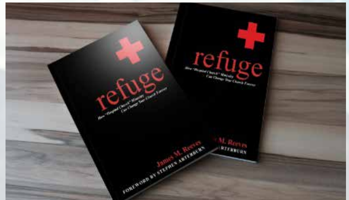
Refuge — How "Hospital Church" Ministry Will Change Your Church Forever $17.95